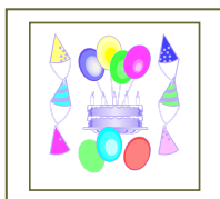
Days to Celebrate!