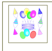
Days to Celebrate!

The Odd Job List is posted on the Bulletin Board by the North Door. Check it out and see how you can serve.