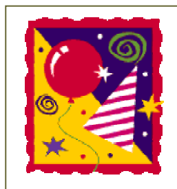
Days to Celebrate!